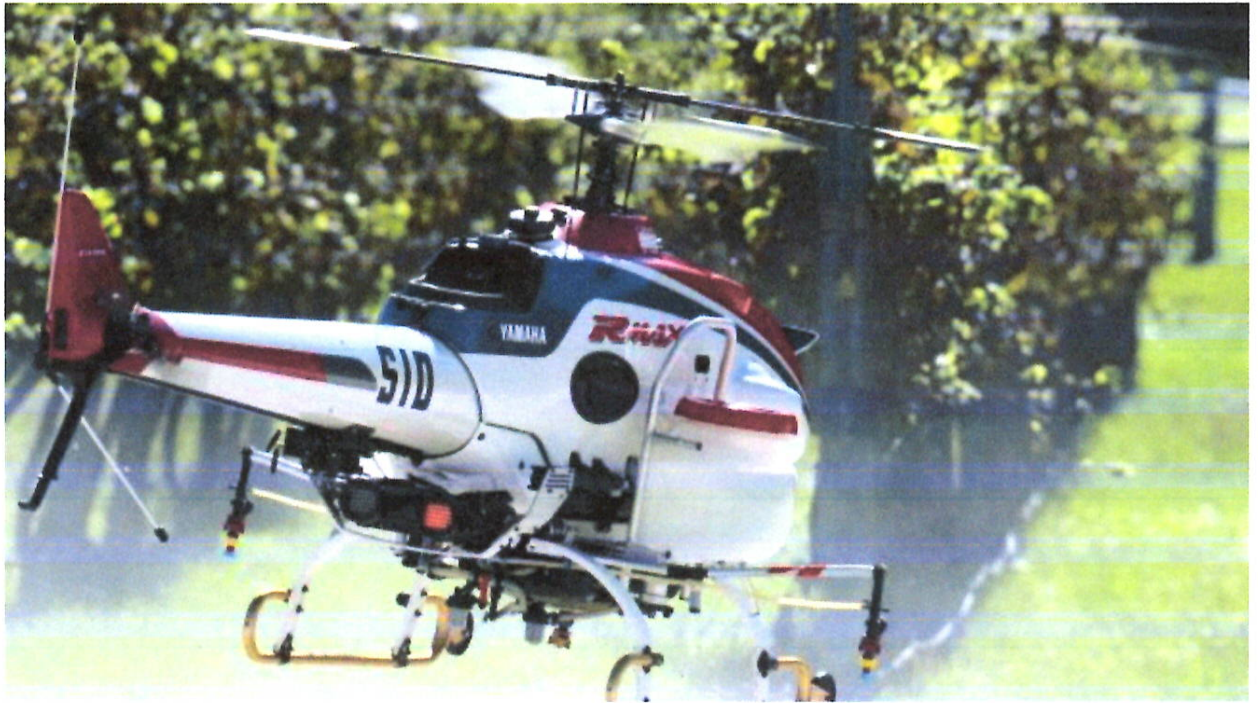
The Yamaha Sky Crew demonstrated the aerial capabilities of their latest UAV (unmanned aerial vehicle) at O'Reillys Vineyard at Canungra.

"It's almost as expensive to buy tractors and other equipment used to tackle weeds and this type of thing can do it quicker — it's got to be pretty advantageous to a working property."